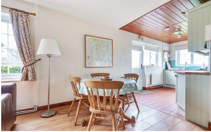
Open-Plan Ground Floor