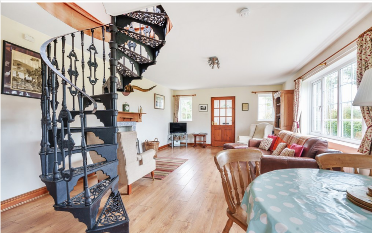
Open-Plan Ground Floor

Description As the name suggests this property was a former Telephone Exchange and was purchased by the current vendors in 1989. Shortly afterwards (1990) they cleverly converted the building into the cosy inviting property it is today. Currently a successful holiday let you certainly would not be disappointed to arrive here for a week or two!