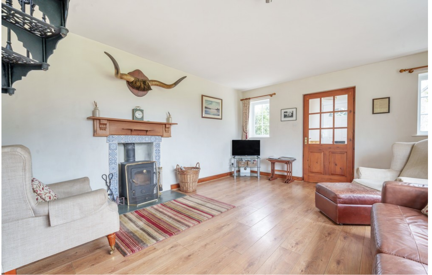
Openplan Ground Floor