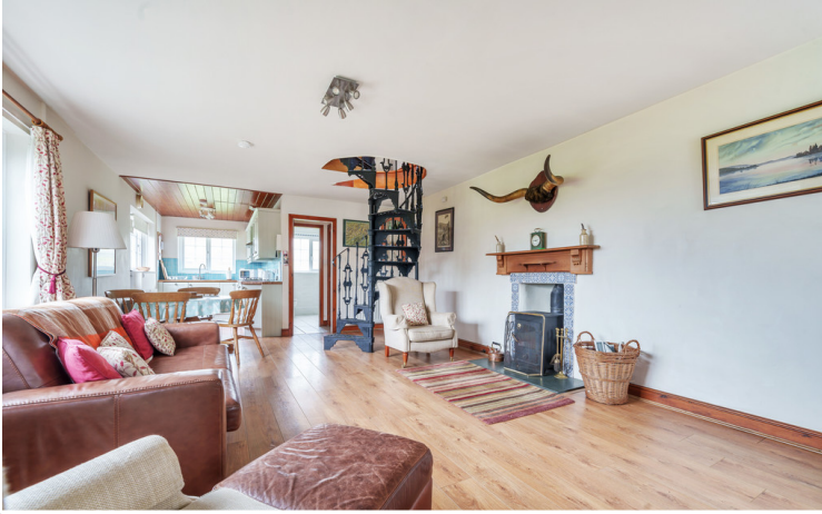
Open-Plan Ground Floor