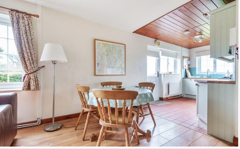
Open-Plan Ground Floor