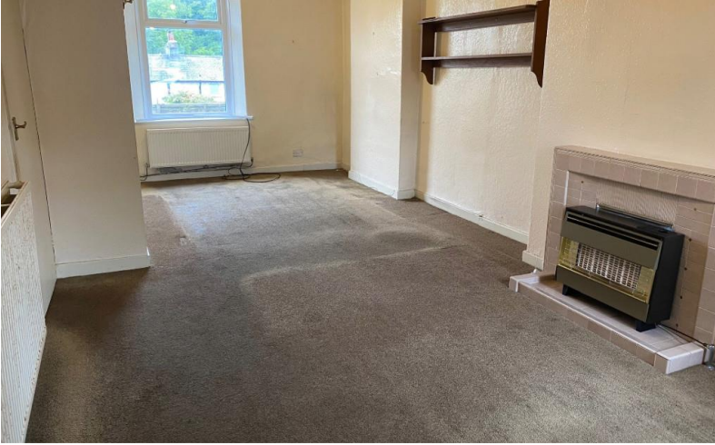
Open Plan Living/Dining Room