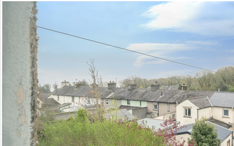
View from Bedroom 1