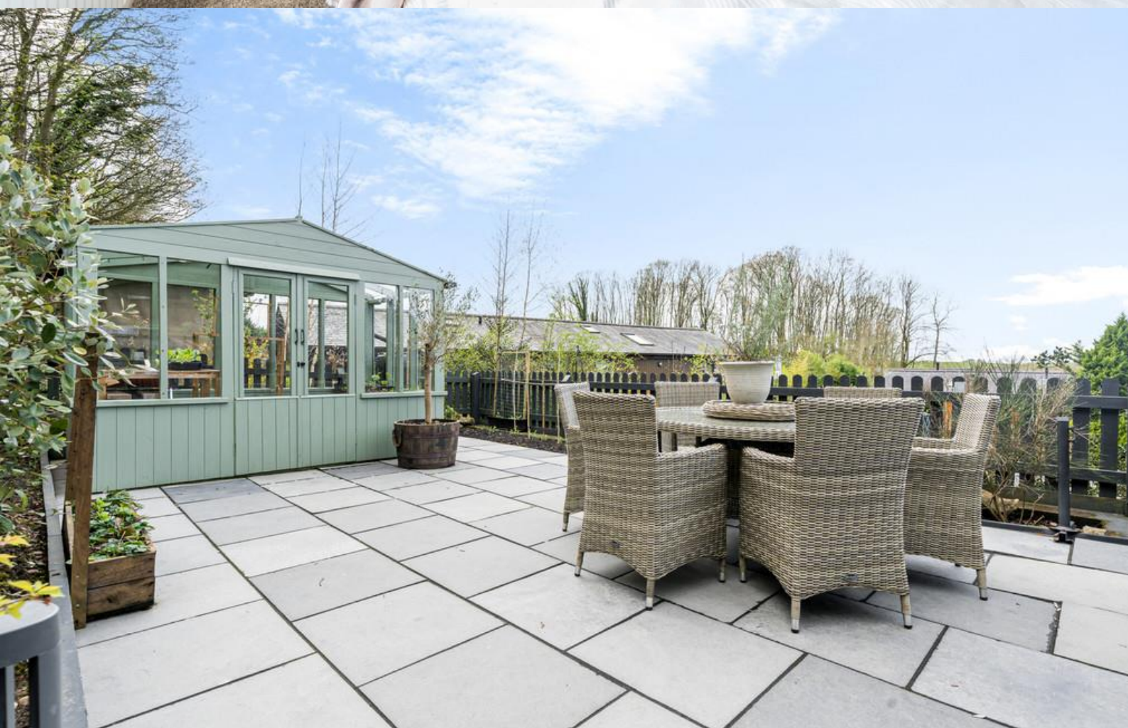
Terrace and Greenhouse