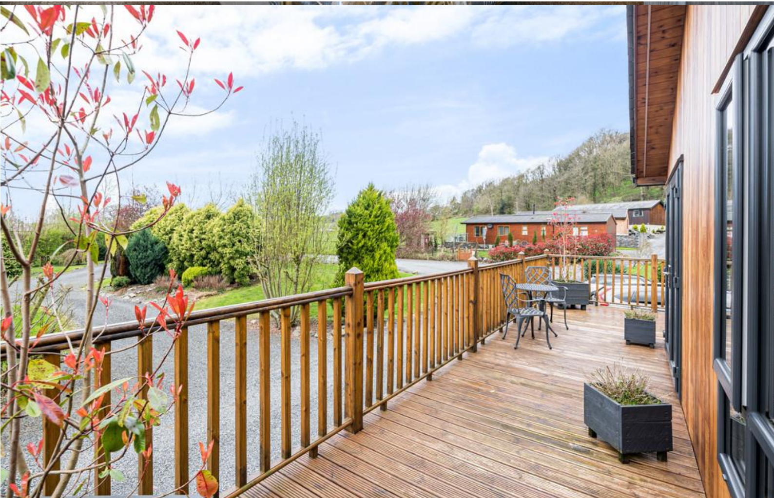
Front Balcony Decking

Request a Viewing Online or Call 015395 32301