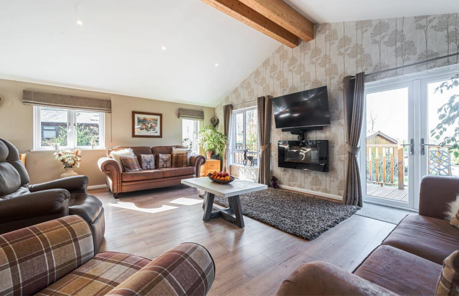
Open plan Living/Dining/Kitchen