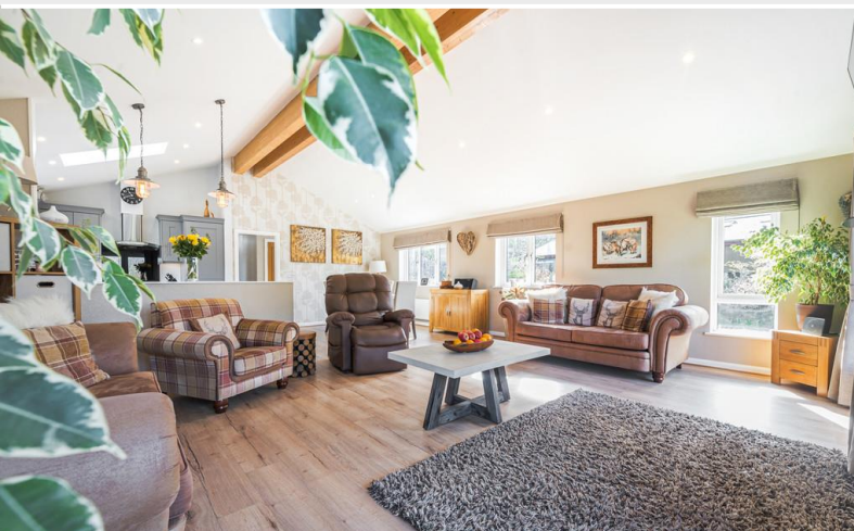
Open plan Living/Dining/Kitchen