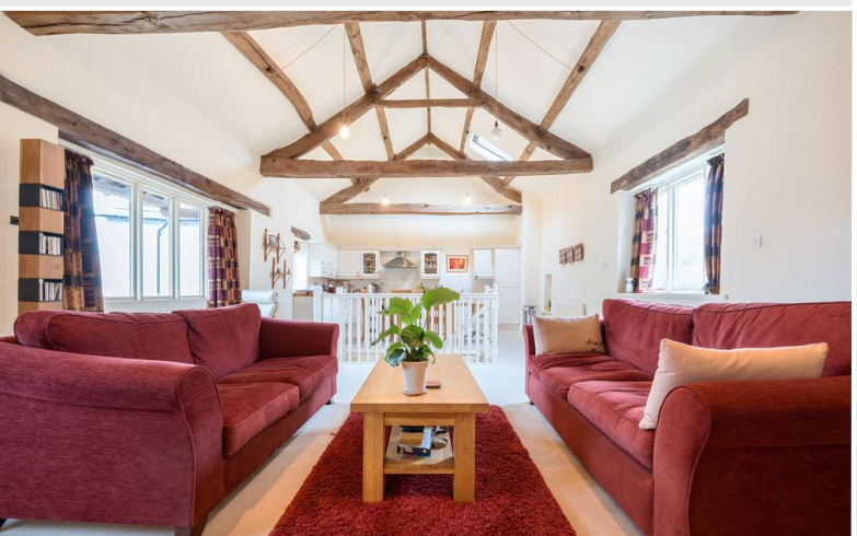
Open Plan Living/Dining/Kitchen