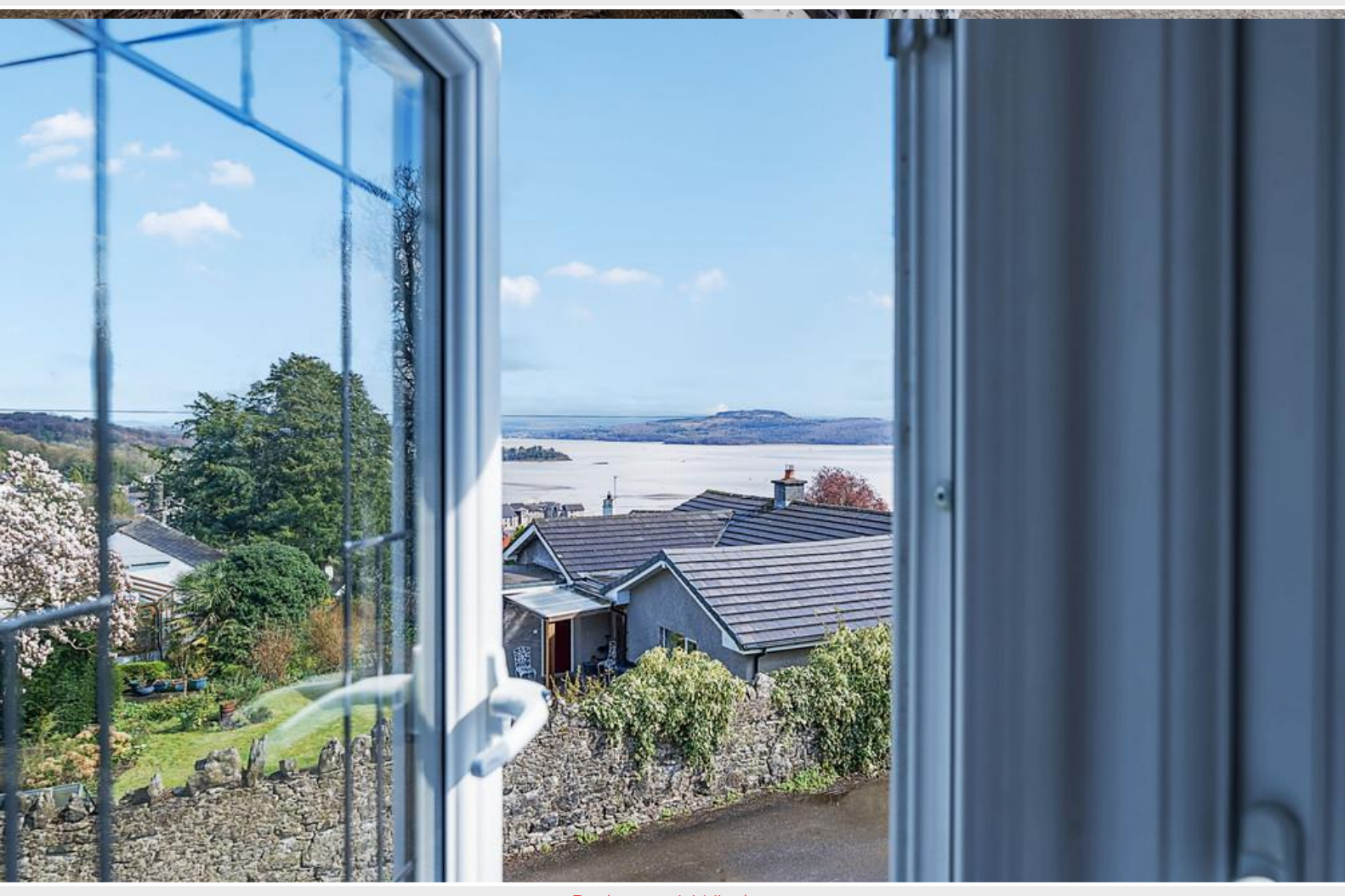
Bedroom 1 Window