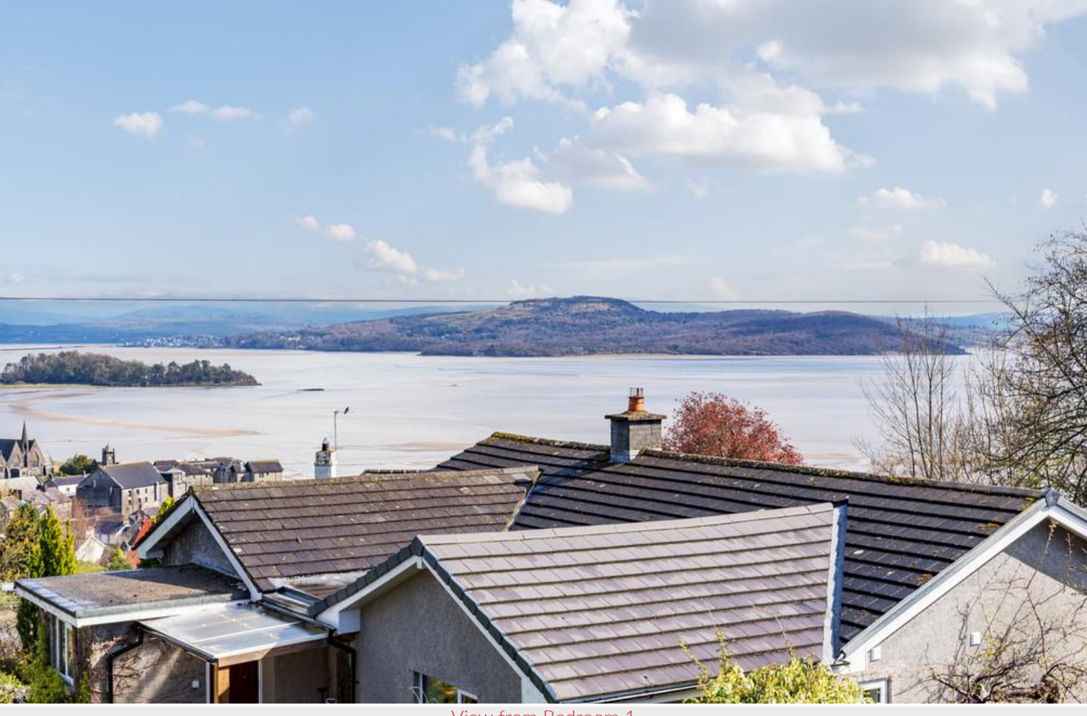
View from Bedroom 1