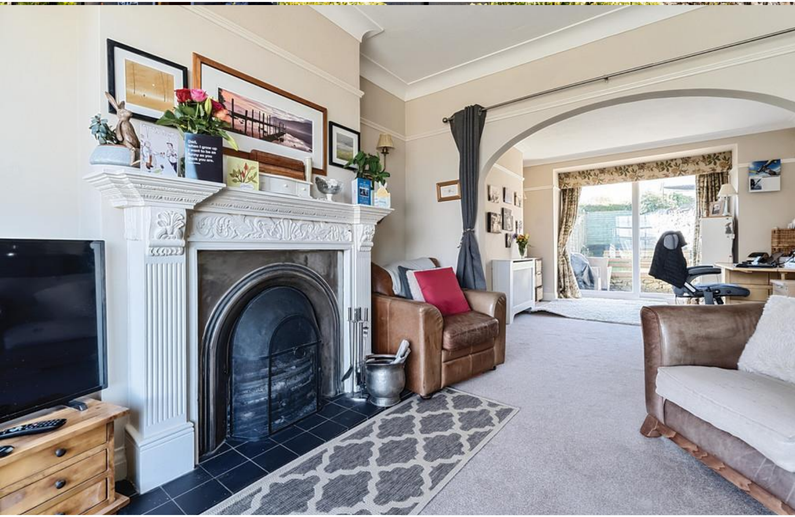
Openplan Lounge and Dining Room