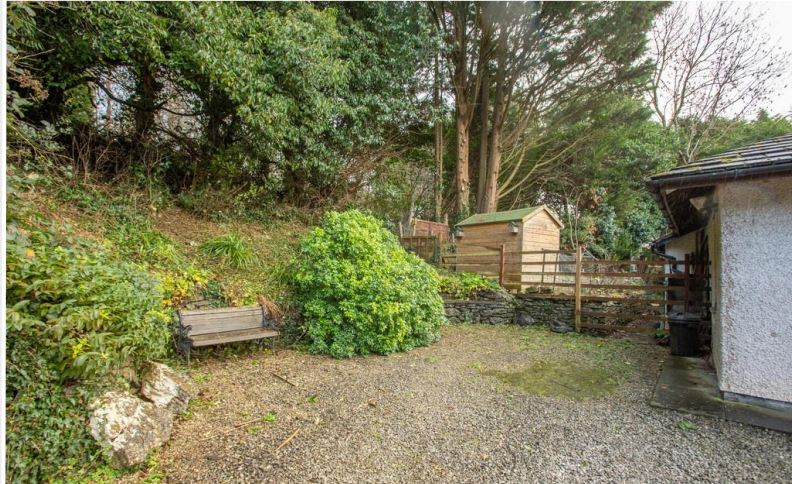
Rear Garden Area