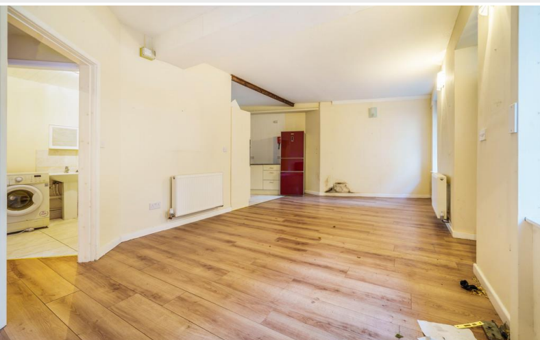
Open Plan Living/Dining Room