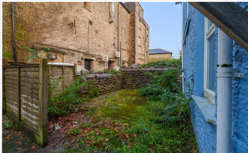
Courtyard and Parking