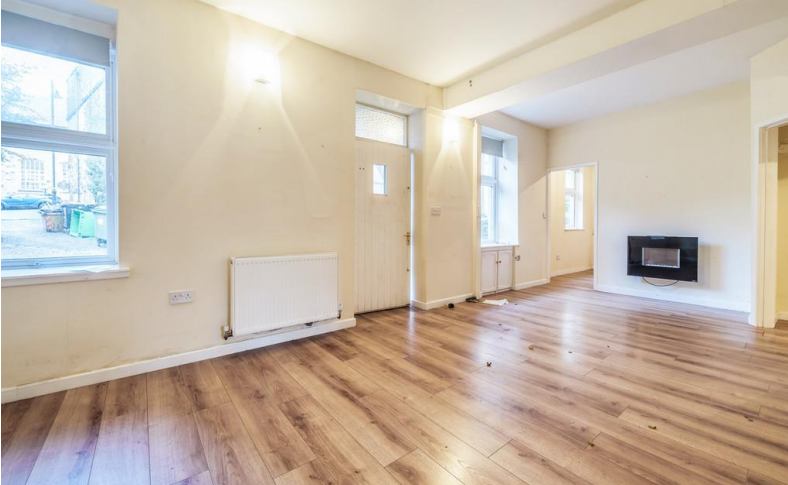
Open Plan Living/Dining Room