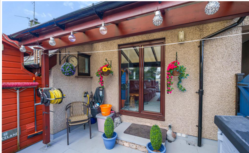
Rear Patio Garden