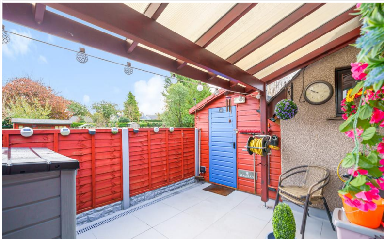
Rear Patio Garden