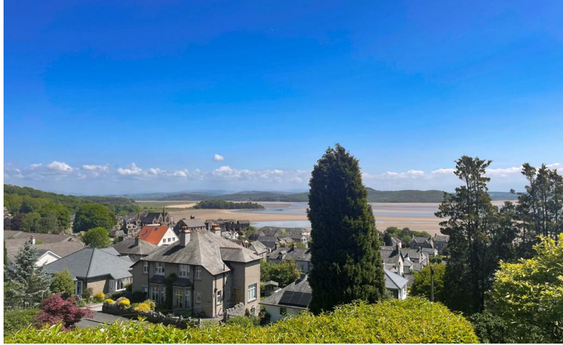
View from Terrace

Anti-Money Laundering Regulations (AML): Please note that when an offer is accepted on a property, we must follow government legislation and carry out identification checks on all buyers under the Anti-Money Laundering Regulations (AML). We use a specialist third-party company to carry out these checks at a charge of £42.67 (inc. VAT) per individual or £36.19 (incl. vat) per individual, if more than one person is involved in the purchase (provided all individuals pay in one transaction). The charge is non-refundable, and you will be unable to proceed with the purchase of the property until these checks have been completed. In the event the property is being purchased in the name of a company, the charge will be £120 (incl. vat).