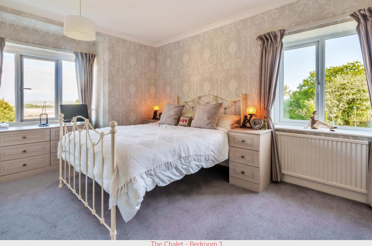
The Chalet - Bedroom 1