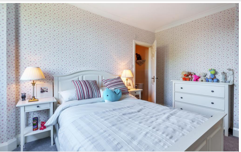
The Chalet - Bedroom 2