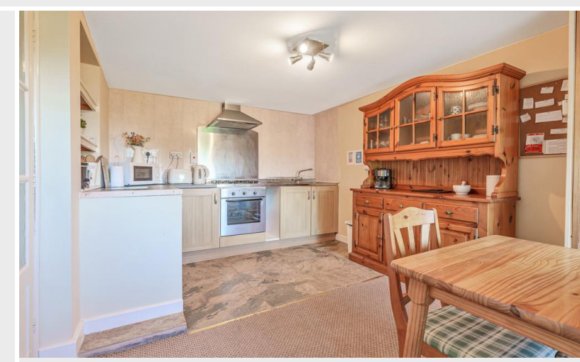
The Garden Flat - Breakfast Kitchen

From the Parking area a pathway to the side of the garage leads you to the Garden Flat. The bistro sitting area gives access to the front door opening to the Breakfast Kitchen where there is a range of base units incorporating the single drainer stainless steel sink unit. Built-in Electrolux oven and hob with cooker hood over; space for washing machine and under counter fridge. Concealed Baxi gas central heating boiler. Door and 3 steps down to the Inner Hall which give access to all rooms. The cosy Sitting Room has a pleasant aspect to the patio area. The Shower Room has a 3 Piece white suite comprising shower enclosure, pedestal wash hand basin and WC. The Bedroom is a good double with a lovely sunny aspect.