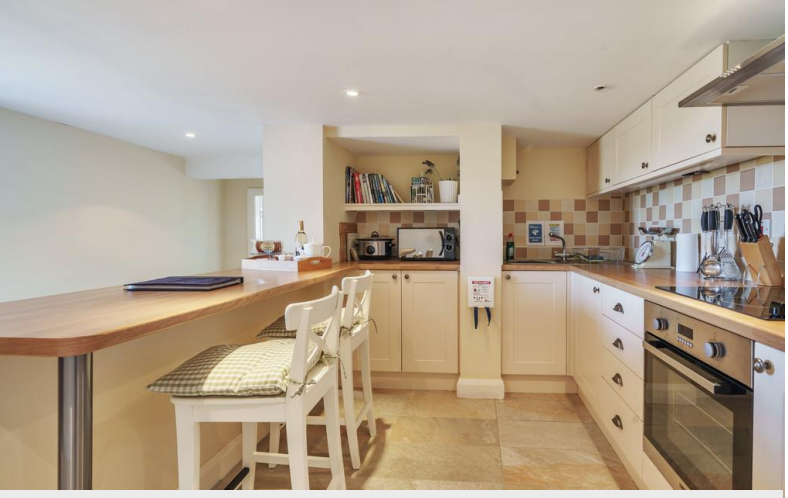
Tides - Breakfasdt Kitchen