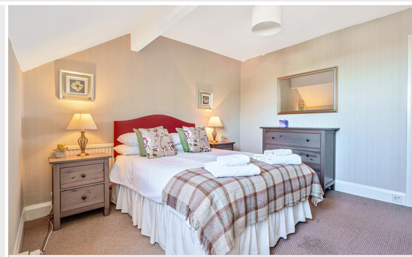
Studio Flat - Bedroom 1