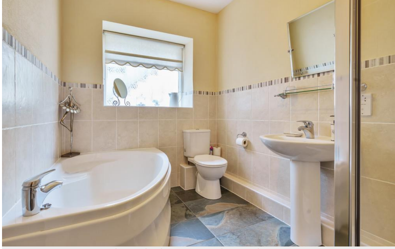
The Chalet - Family Bathroom

To reach the property from Grange-over-Sands proceed up Grange Fell Road past the Library. Just past the 4th right (Eden Mount Road) turn left - signed 'The Chalet'. The property is at the end of the road on the the left hand side.