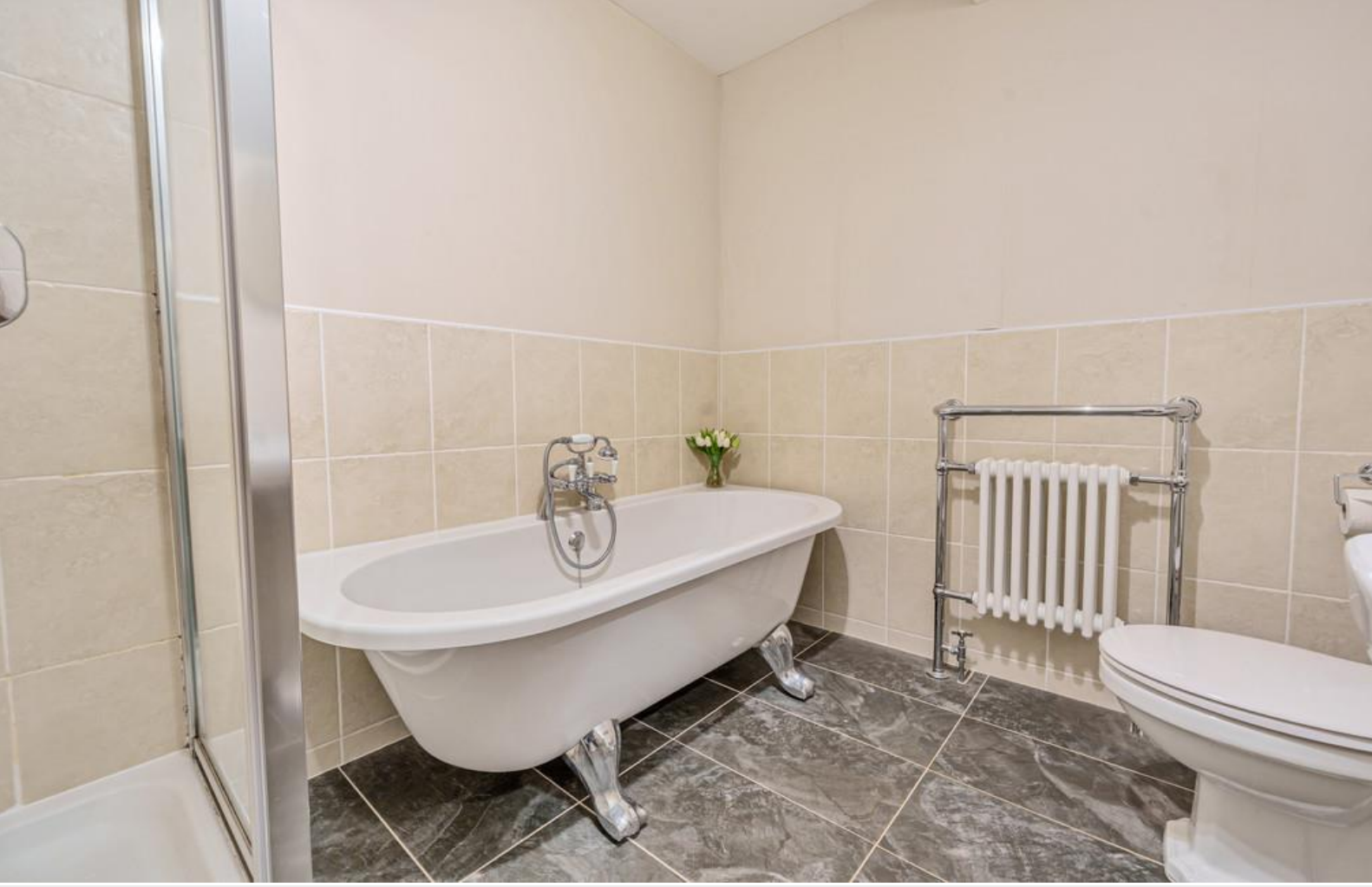
Studio Flat - Bathroom