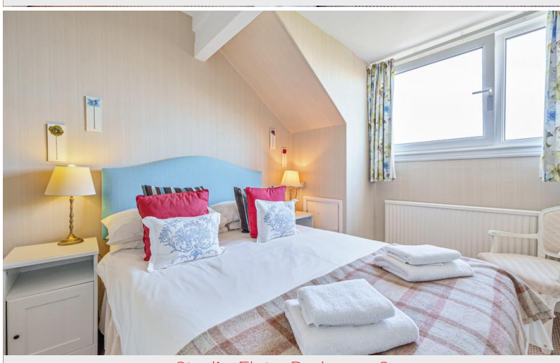
Studio Flat - Bedroom 2