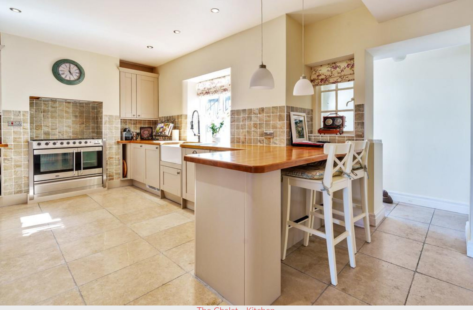
The Chalet - Kitchen