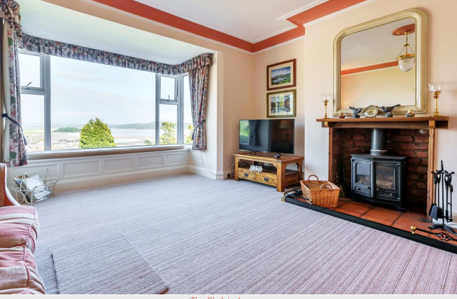
The Chalet - Lounge