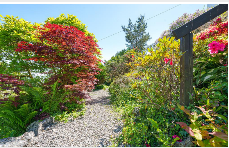
The Chalet - Garden