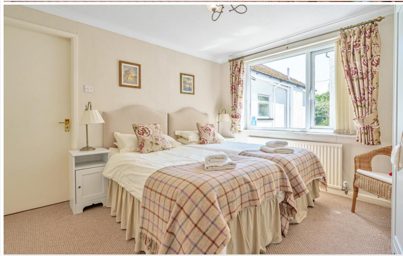
The Garden Flat - Bedroom