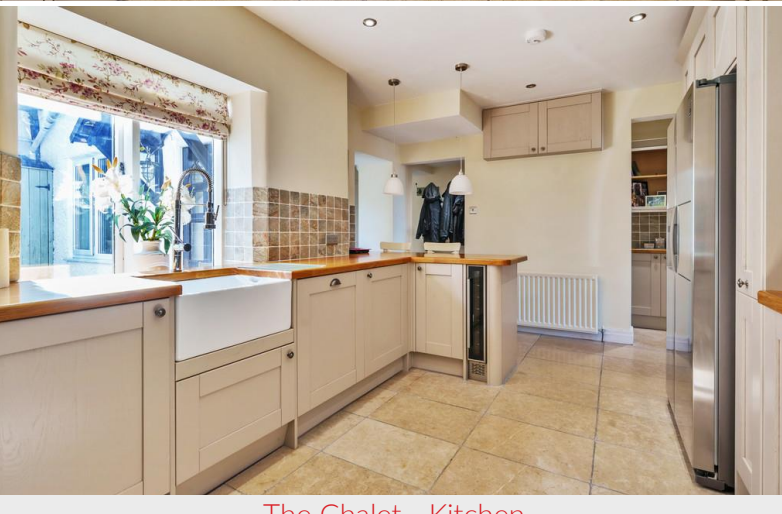
The Chalet - Kitchen