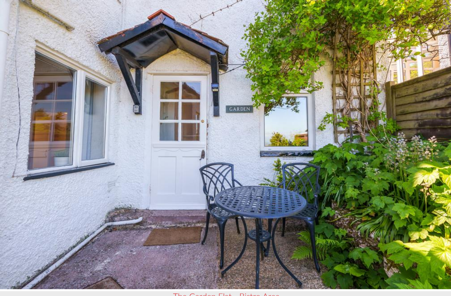
The Garden Flat - Bistro Area