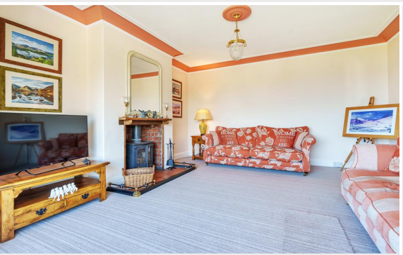
The Chalet - Lounge