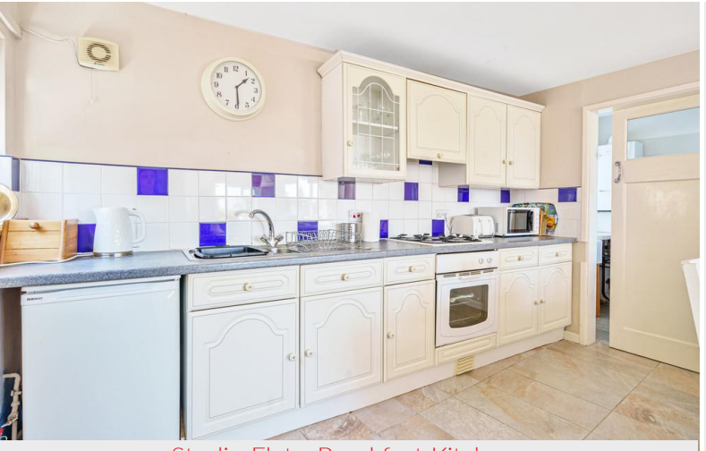
Studio Flat - Breakfast Kitchen