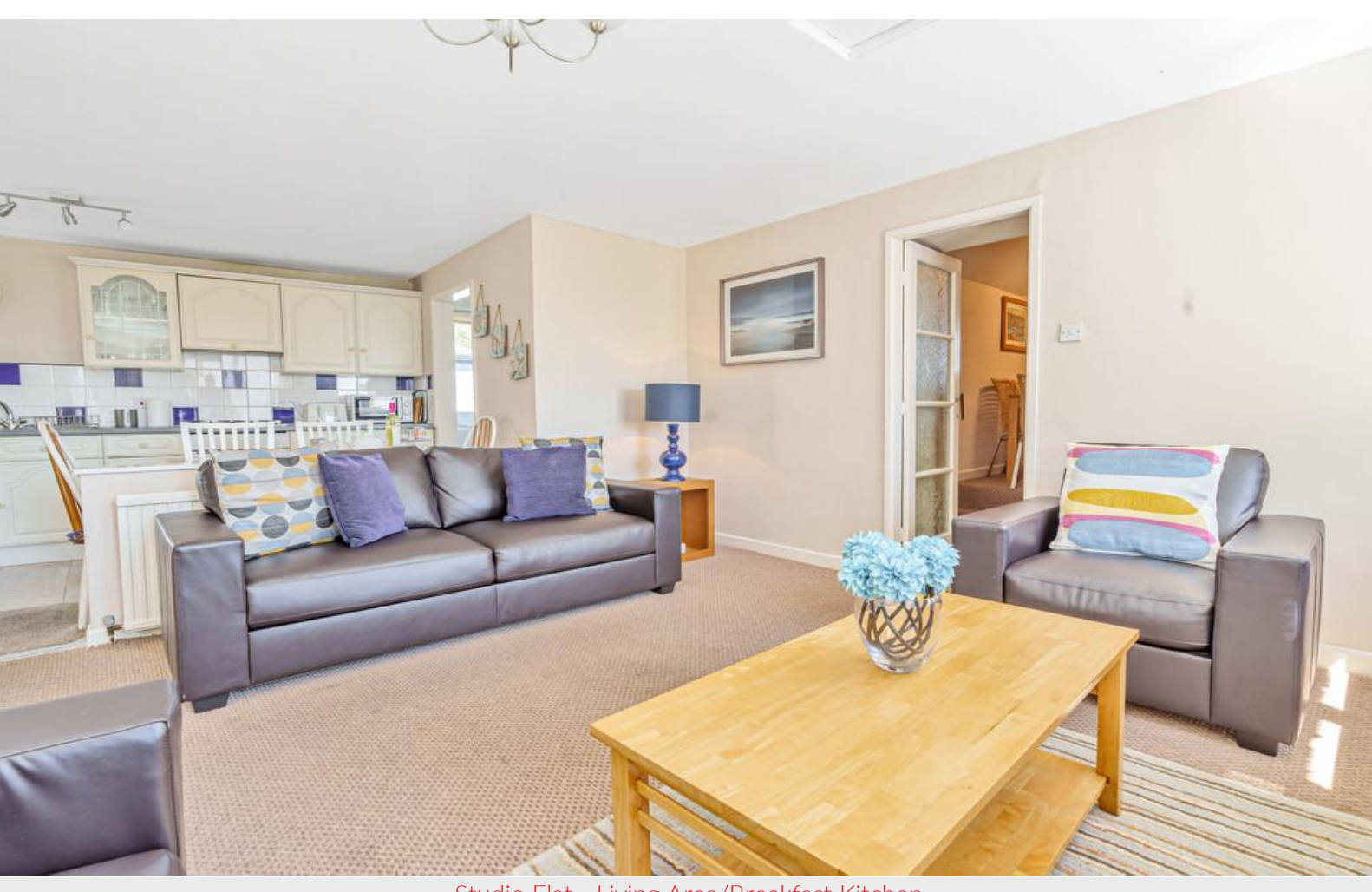
Studio Flat - Living Area/Breakfast Kitchen