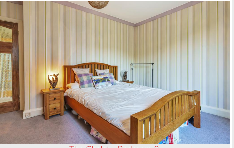
The Chalet - Bedroom 3

Shower Room with 3-piece white suite comprising shower cubicle, wash hand basin and WC.