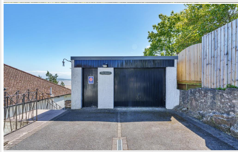
The Chalet - Garage and Parking