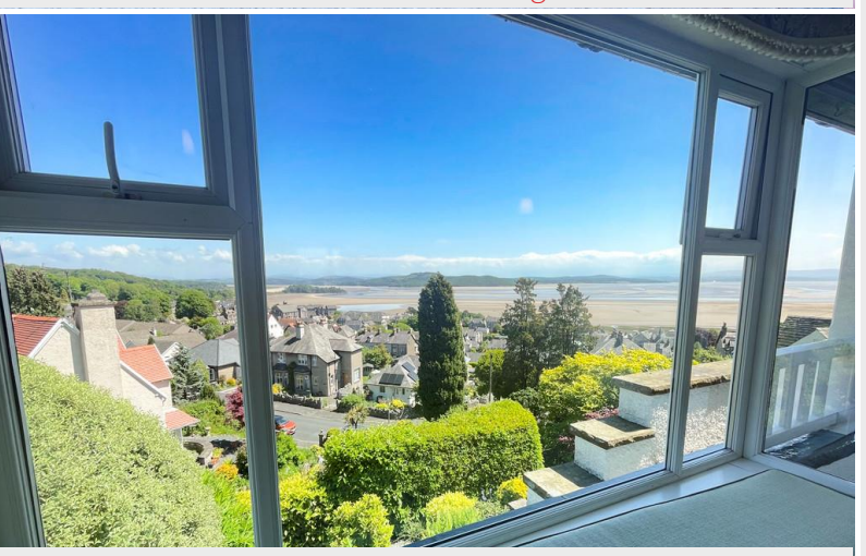
View from Dining Room

Description: In the picturesque town of Grange-over-Sands, there stood a magnificent property, a hidden gem, nestled amidst its delightful gardens and looking out to the breath-taking views of Morecambe Bay and the Fells beyond. This fabulous detached property held within it, immense investment potential.