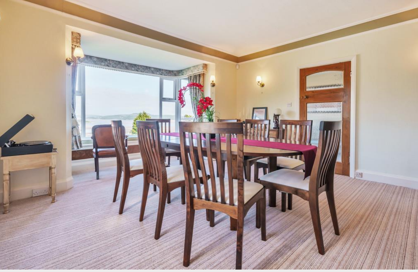
The Chalet - Dining Room