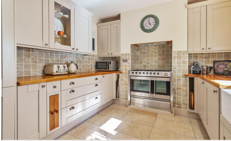
The Chalet - Kitchen

Bedroom 1 is a good sized double with a dual aspect with outstanding views towards the Bay and access to the En-Suite