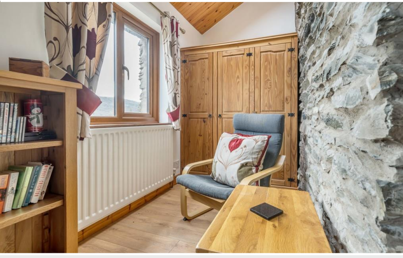
Lounge - Quiet Area

Description Converted in 2000, 4 The Barns is the most charming and quirky of properties - with thick imperfect exposed stone walls, deep set windows and exposed beams arranged over many levels and with lots of nooks and crannies! If completely unique with charm and charachter and superb open views are your thing then look no further - this will not disappoint.