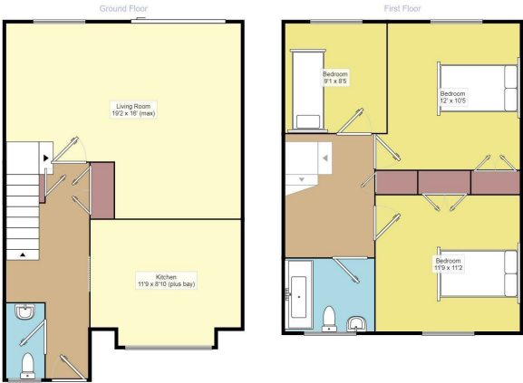
Measurements are approximate. Not to scale. For illustrative purposes only.