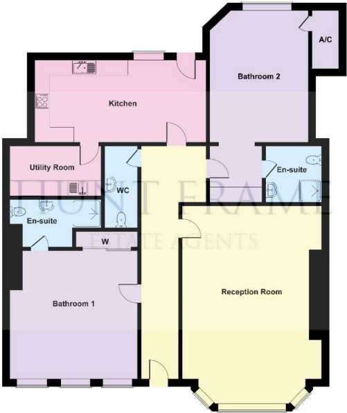
LOWER GROUND FLOOR Not to Scale. Produced by The Plan Portal on behalf of Hunt Frame. For Illustrative.