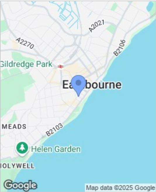
9 Lathom House

Share of freehold with approximately 992 year lease. Maintenance, approximately £1500 PA, TBC. Council Tax Band C Permission for pets may be sought from the Managing Agents.