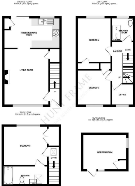
TOTAL FLOOR AREA : 1047 sq.ft. (97.3 sq.m.) approx. Whilst every attempt has been made to ensure the accuracy of the floorplan contained here, measurements of doors, windows, rooms and any other items are approximate and no responsibility is taken for any error, omission or mis-statement. This plan is for illustrative purposes only and should be used as such by any prospective purchaser. The services, systems and appliances shown have not been tested and no guarantee as to their operability or efficiency can be given. Made with Metropix ©2024

In a white suite comprising panelled bath with shower above, low level wc, vanity