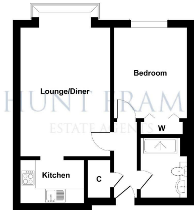
Not to Scale. Produced by The Plan Portal on behalf of Hunt Frame. For Illustrative.