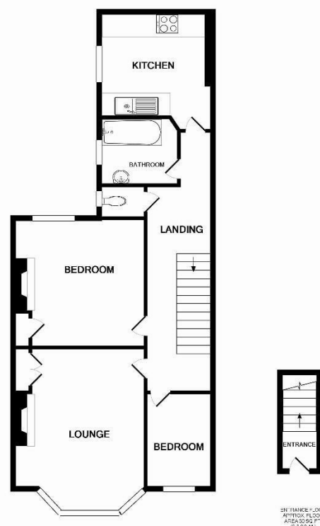
1ST FLOOR APPROX. FLOOR AREA 609 SQ.FT. (56.5 SQ.M.) TOTAL APPROX. FLOOR AREA 639 SQ.FT. (59.3 SQ.M.)

While every effort has been made to ensure the accuracy of the floor plan, the seller, the estate agent, the surveyor and the mortgage lender accept no responsibility for any errors, omissions or misstatements. The plan is for general information only and should be used as a guide only by prospective purchasers. Please refer to the Energy Performance Certificate.