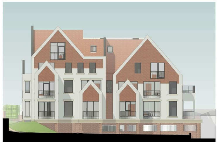
3 Side Elevation South SE - Ashburnham rd 1:100