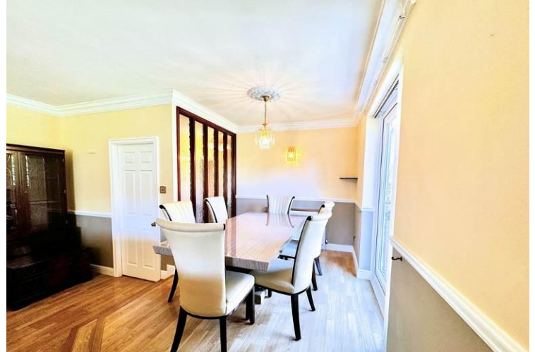
Raised Dining Area