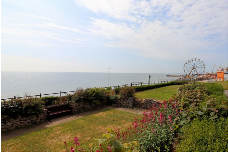
Views to Beach