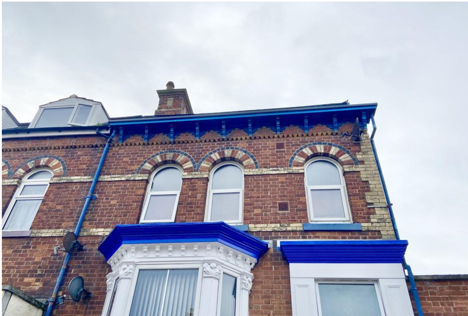
View of Flat