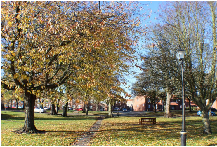
Views of Bridlington