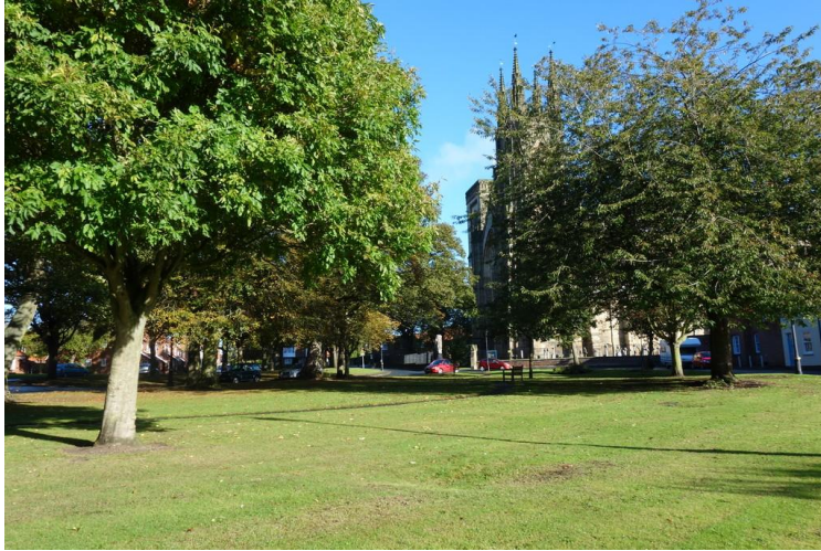
Views of Priory Church