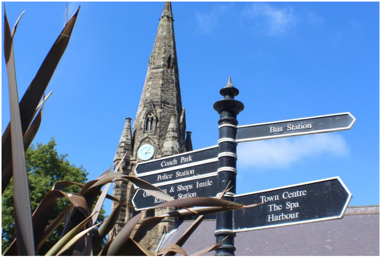
Places to Visit