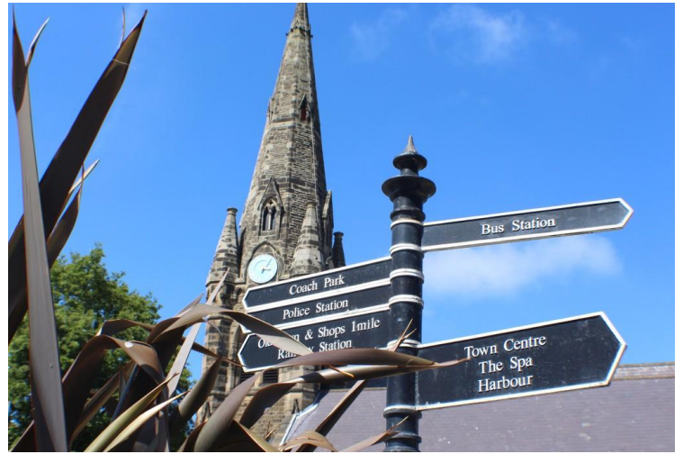
Places to Visit