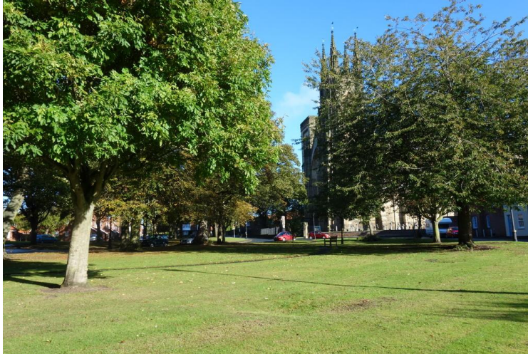
Views of Priory Church