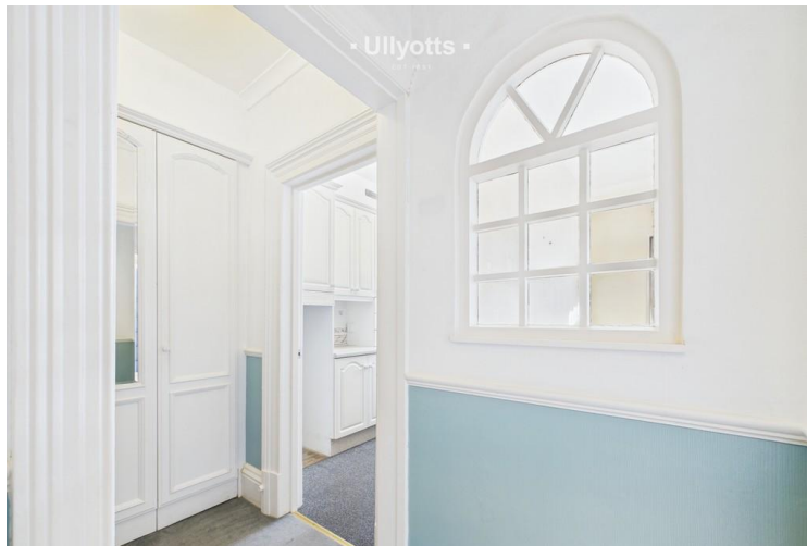
Private Entrance Hall