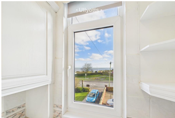
View from Kitchen