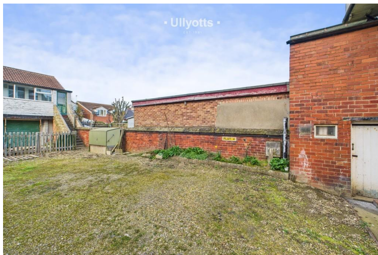
Allocated Parking Area