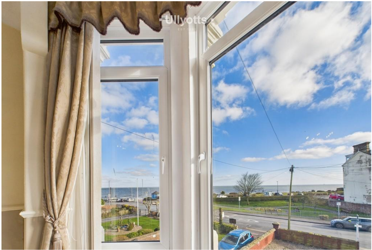
View from Lounge