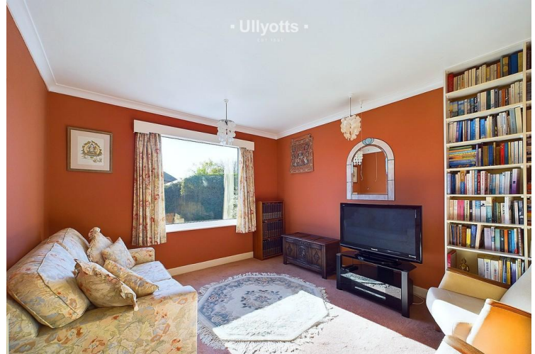
Sitting Room / Bedroom 2