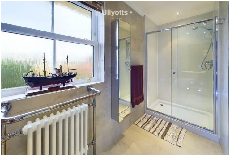
Family bathroom shower