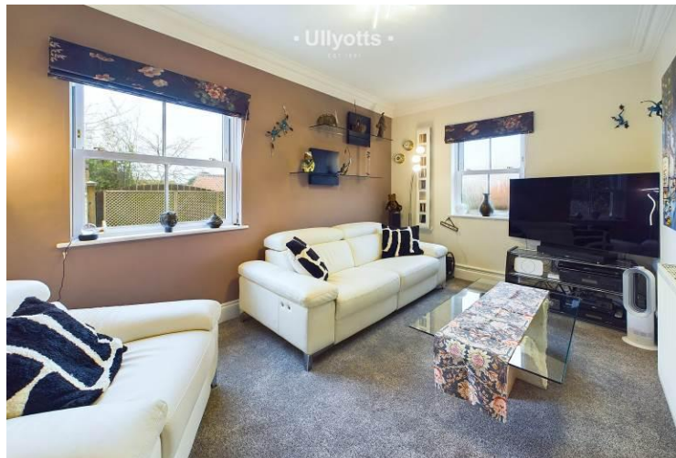
Bedroom 5 / snug