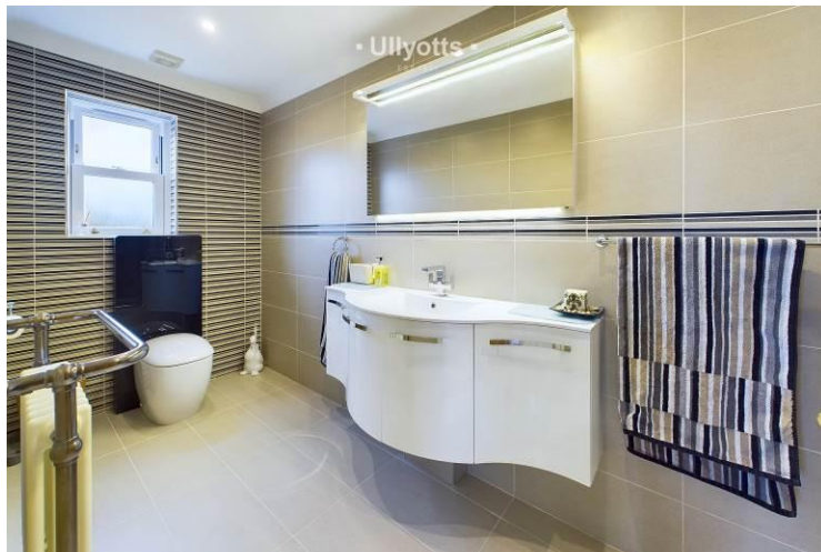
Bedroom 2 Ensuite