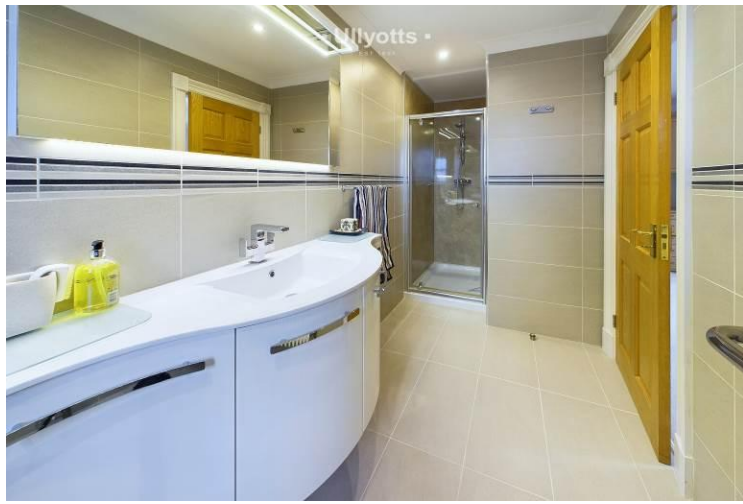
Bedroom 2 ensuite