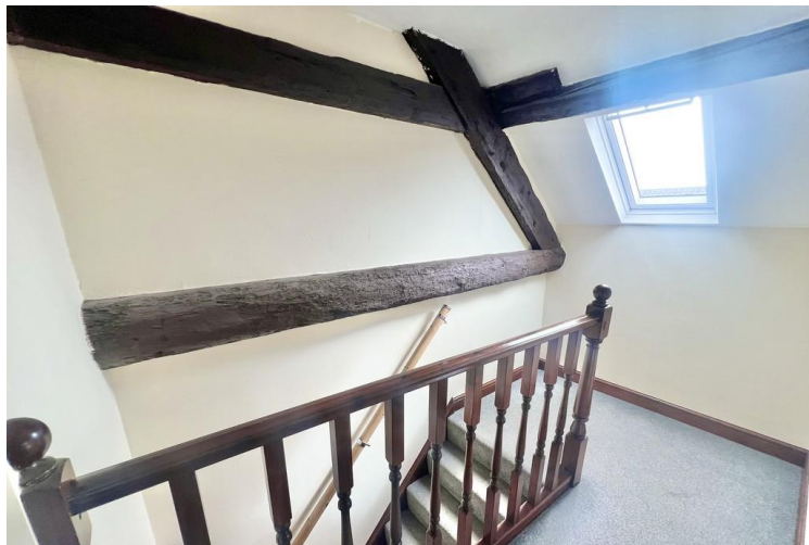
Hall way staircase