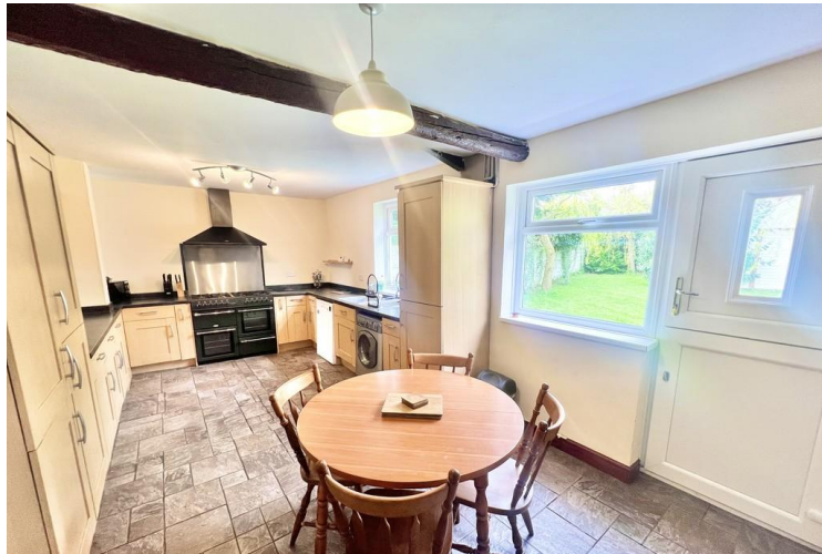
Kitchen / diner