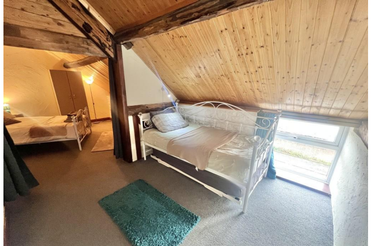
dressing room / Bedroom 5