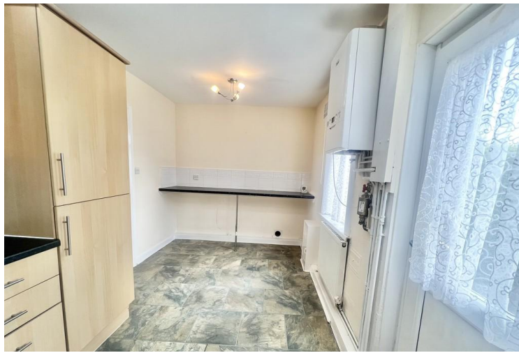
Kitchen / dining area