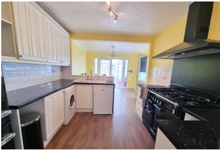
Kitchen / Dining Room