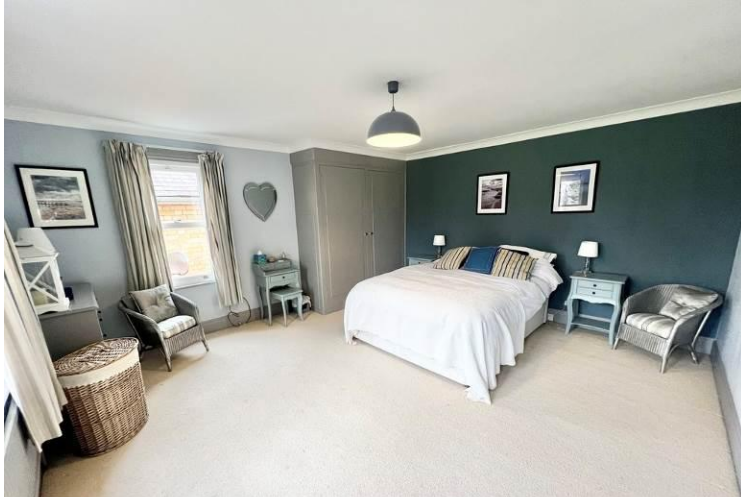
Cottage Bedroom 1