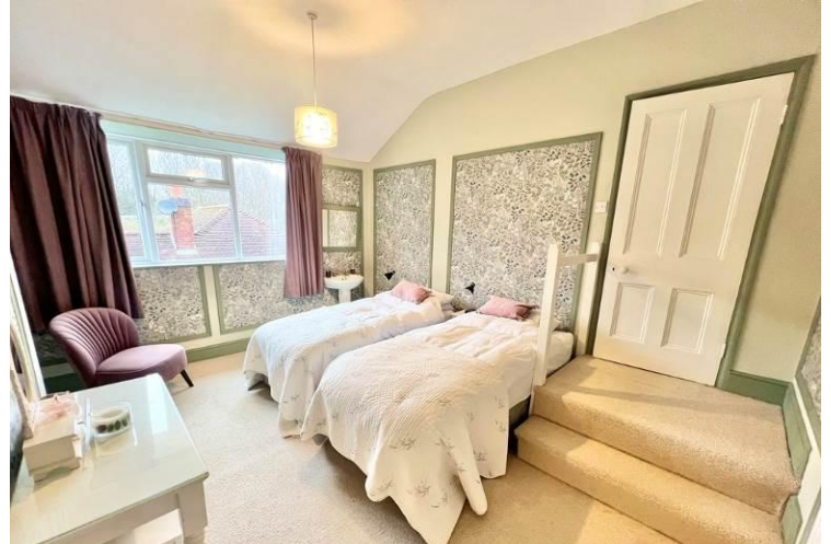
Cottage Bedroom 2