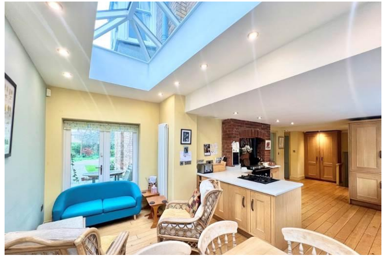
Sunroom and kitchen