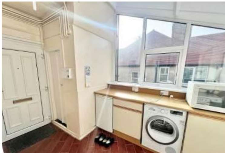
Utility Entrance Hall