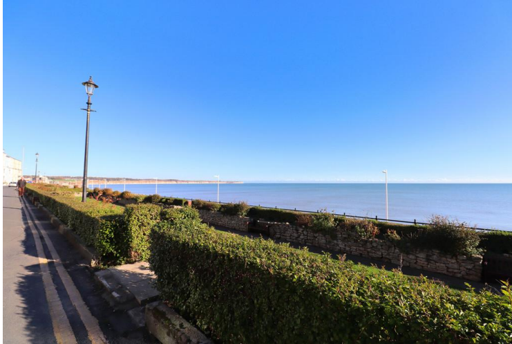
View from inside the property