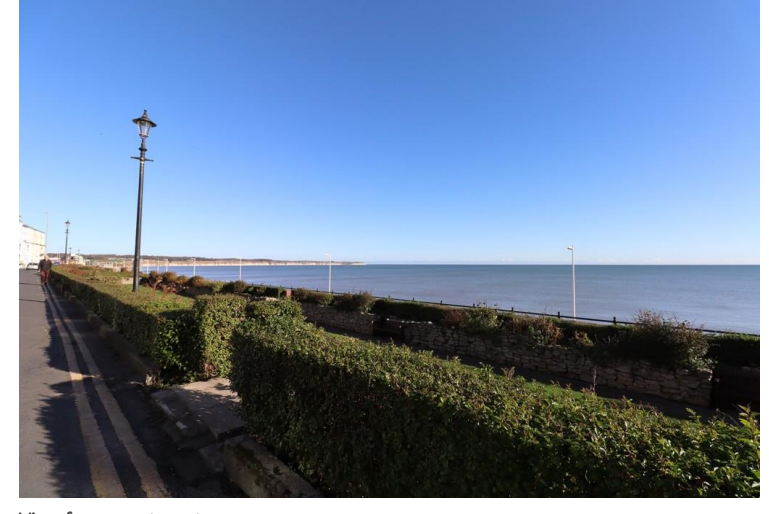
View from apartment

Wall and base units, electric oven, hob and extractor, built-in fridge, breakfast bar, stainless steel sink and mixer tap, work surface over, tiled splash back, electric panel heater, vinyl flooring and window to front elevation.