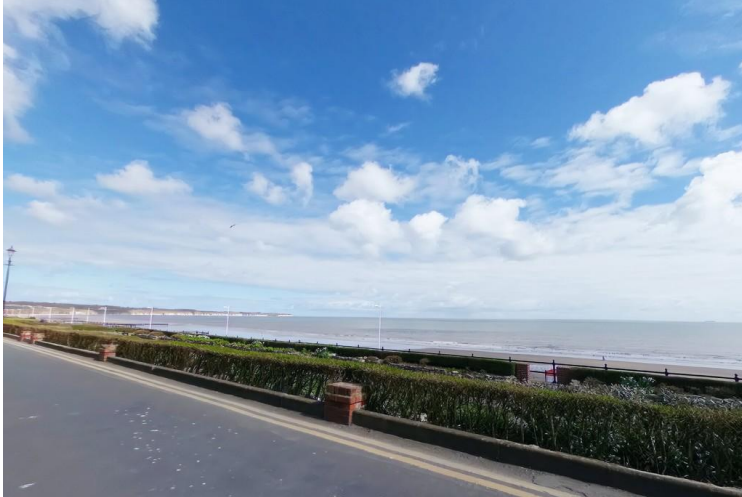
Sea side views