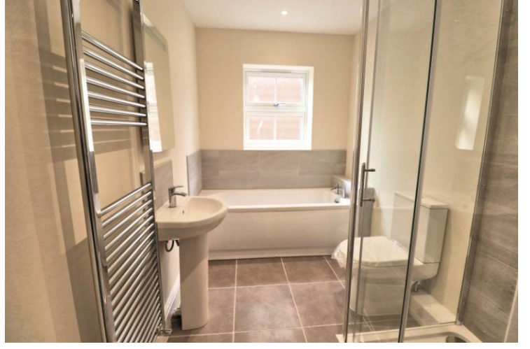
Bathroom (Image from No' 2 Charlton Close)