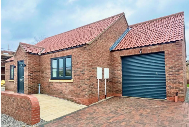
Front Side Elevation