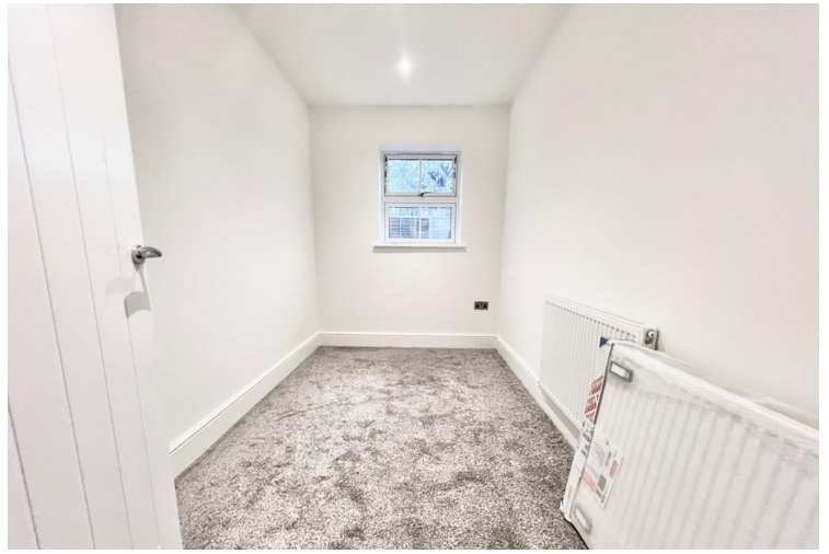
Bedroom Three / Dining Room