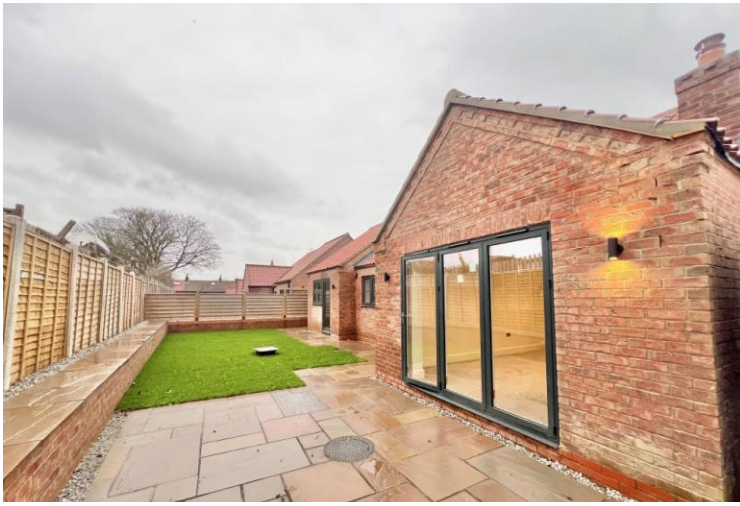
Rear Side Elevation