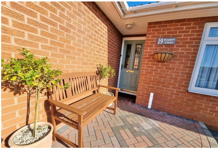
Front Close Up