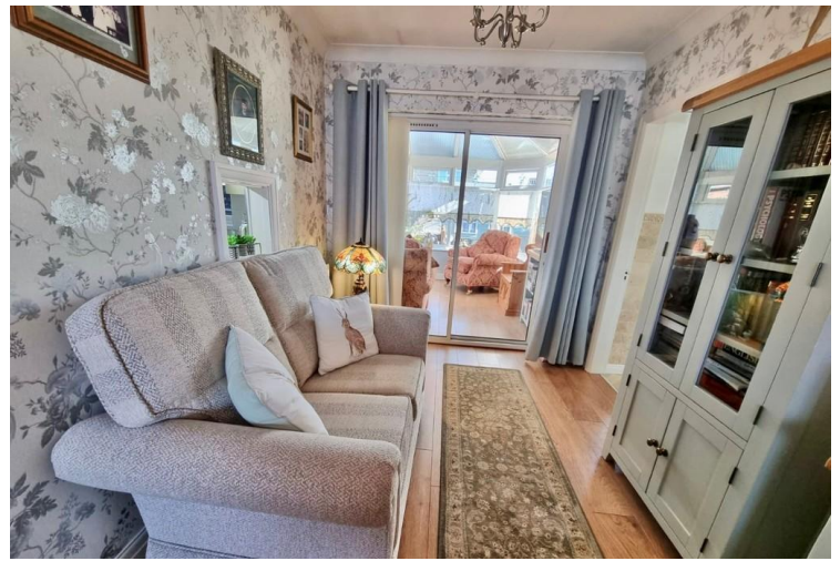
Dining / Seating Area