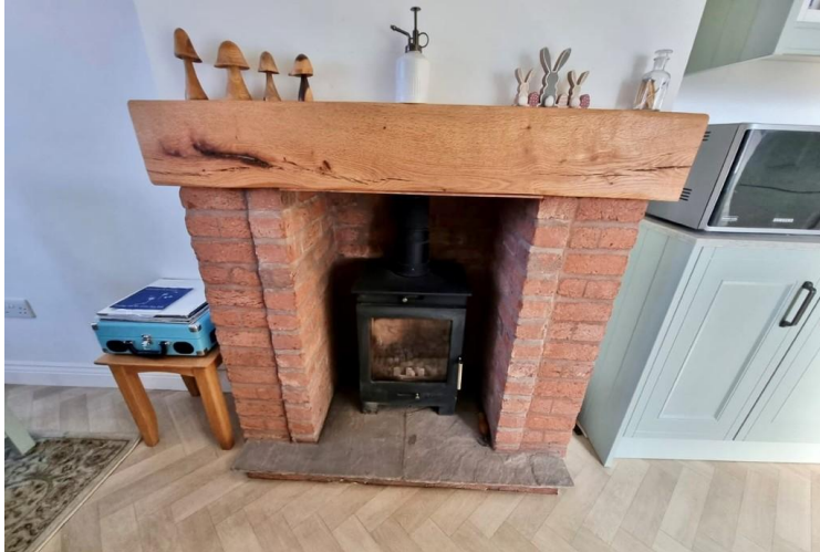
Kitchen - Feature Fireplace