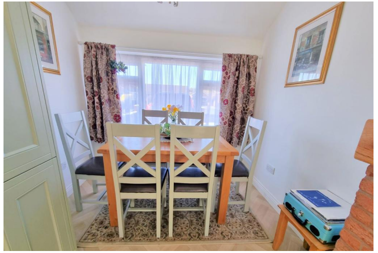
Kitchen - Dining Area