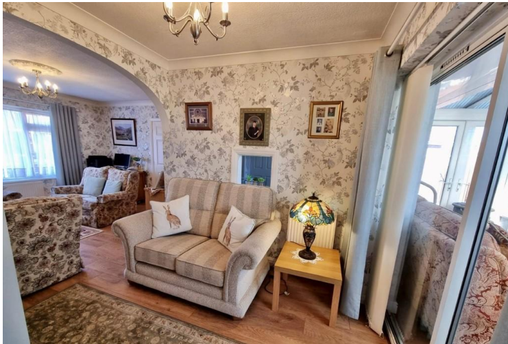
Dining / Seating Area