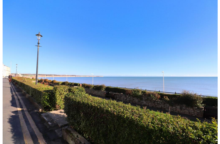
View from inside the property