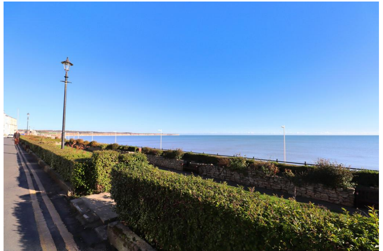
View from inside the property