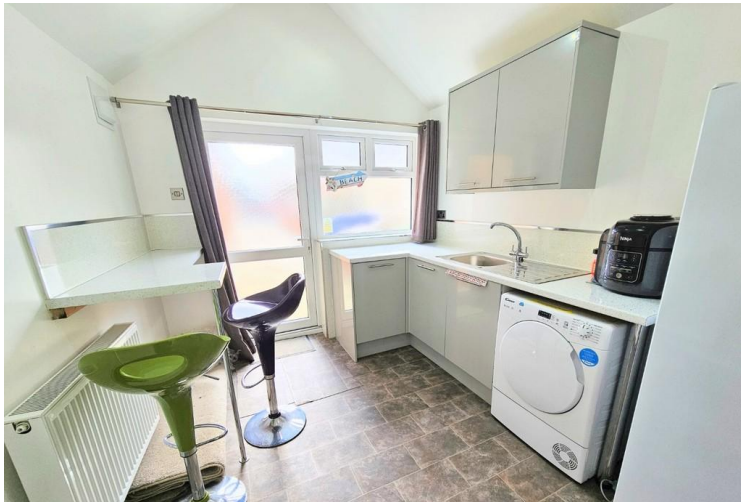
Kitchen / Living Room