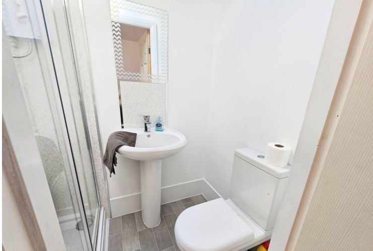
Bedroom 4 Ensuite