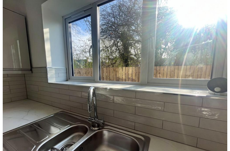
View from Kitchen