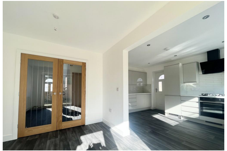
Kitchen Dining Area