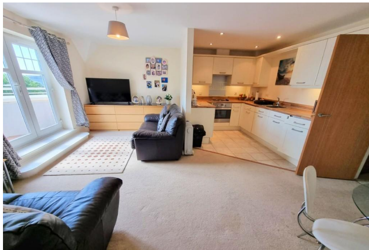
Lounge / Kitchen Diner