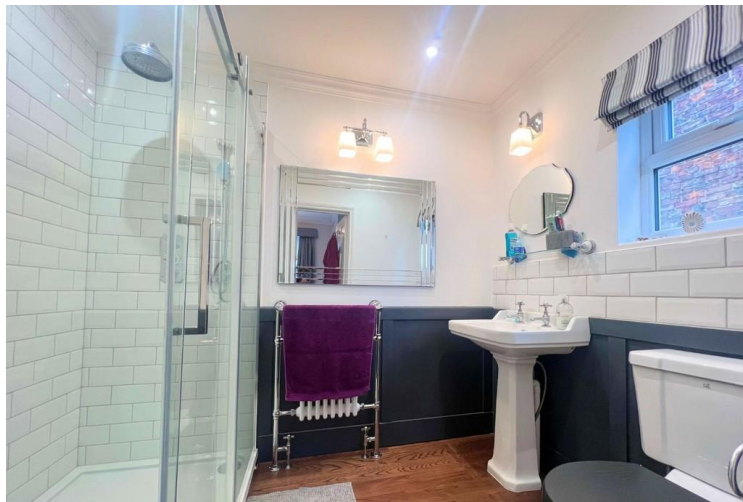
Bedroom 2 - Ensuite