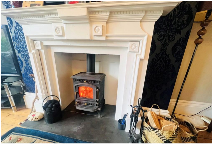
Dining Room Feature Fireplace