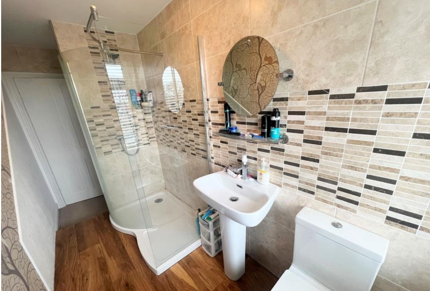
Second Floor Shower Room