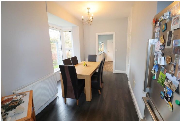
Dining Room / Breakfast Area