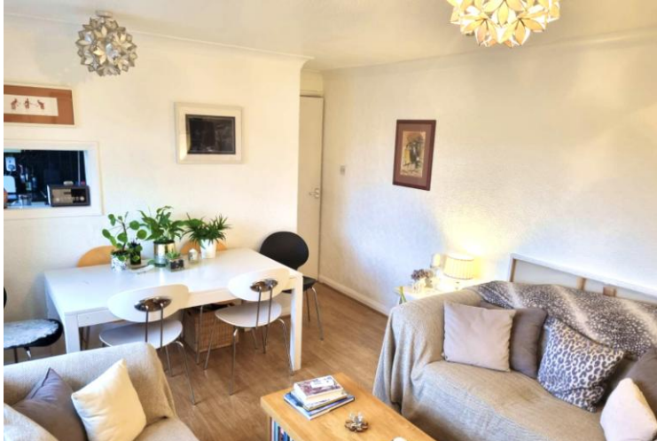
Lounge / Dining