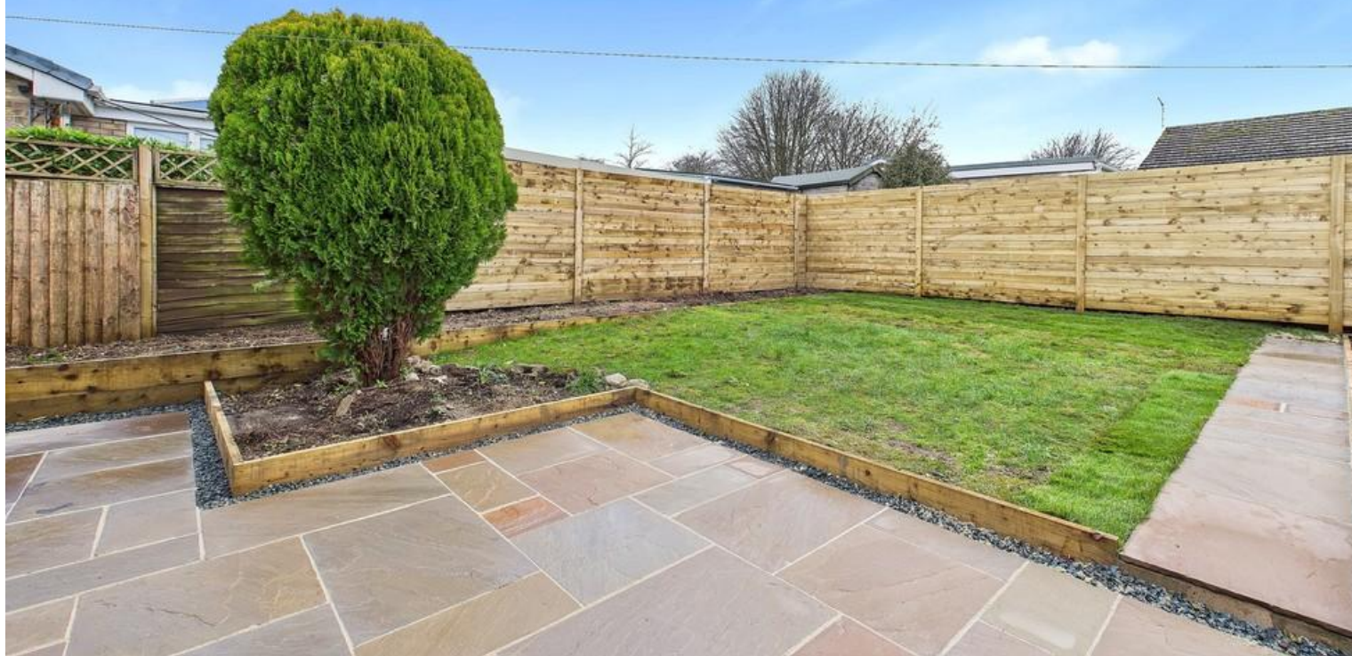
Patio and garden