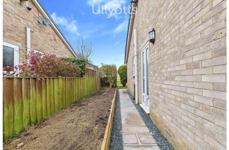
Side of bungalow

We understand that the property is freehold and is offered with vacant possession upon completion.