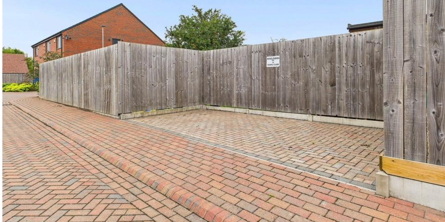
Allocated parking space