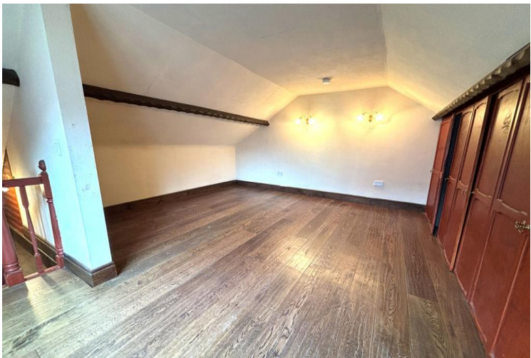
First Floor Bedroom