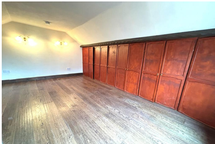
First Floor Bedroom