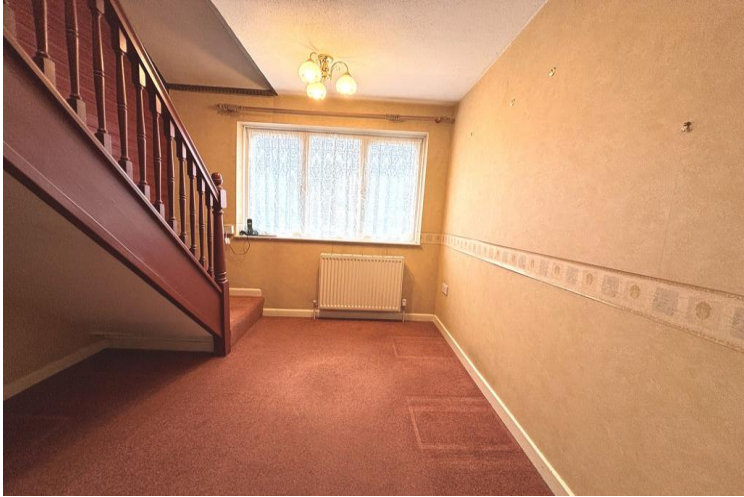
Bedroom 2/Dining Room