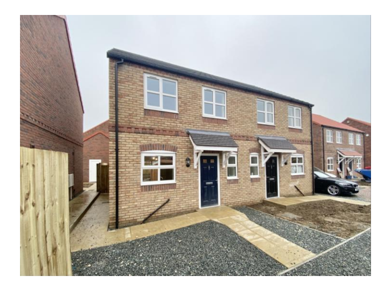
The Hornbeam – 3 bed semi-detached house (856 sq ft)

The following have been selected as they have similarities to 'The Chestnut'