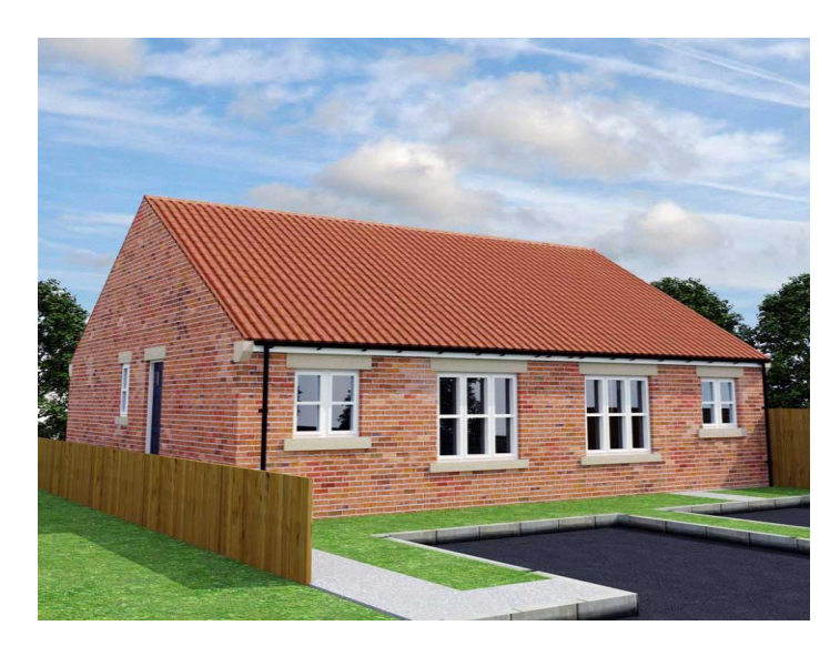
The Palm – 2 bed semi-detached bungalow (615 sq ft)