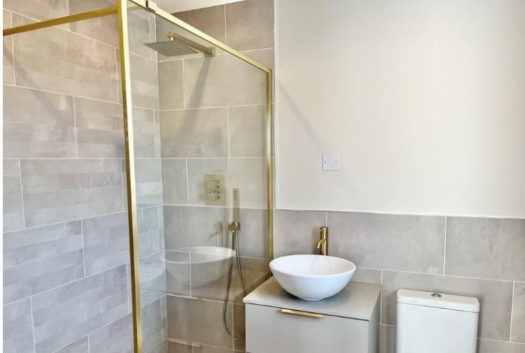
En Suite example