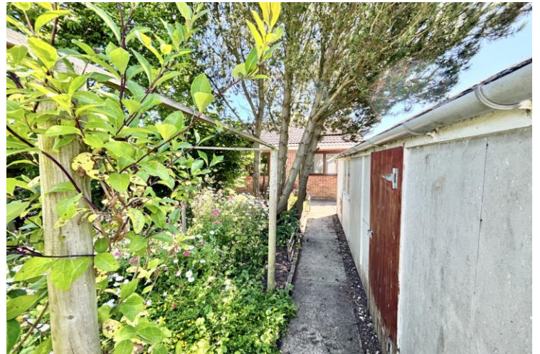
Pathway to Garden