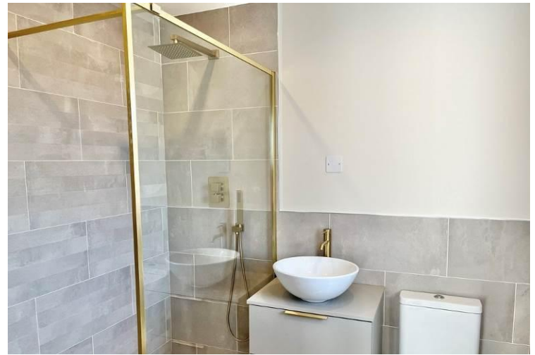
En Suite example