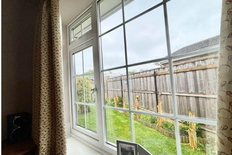
View from Lounge