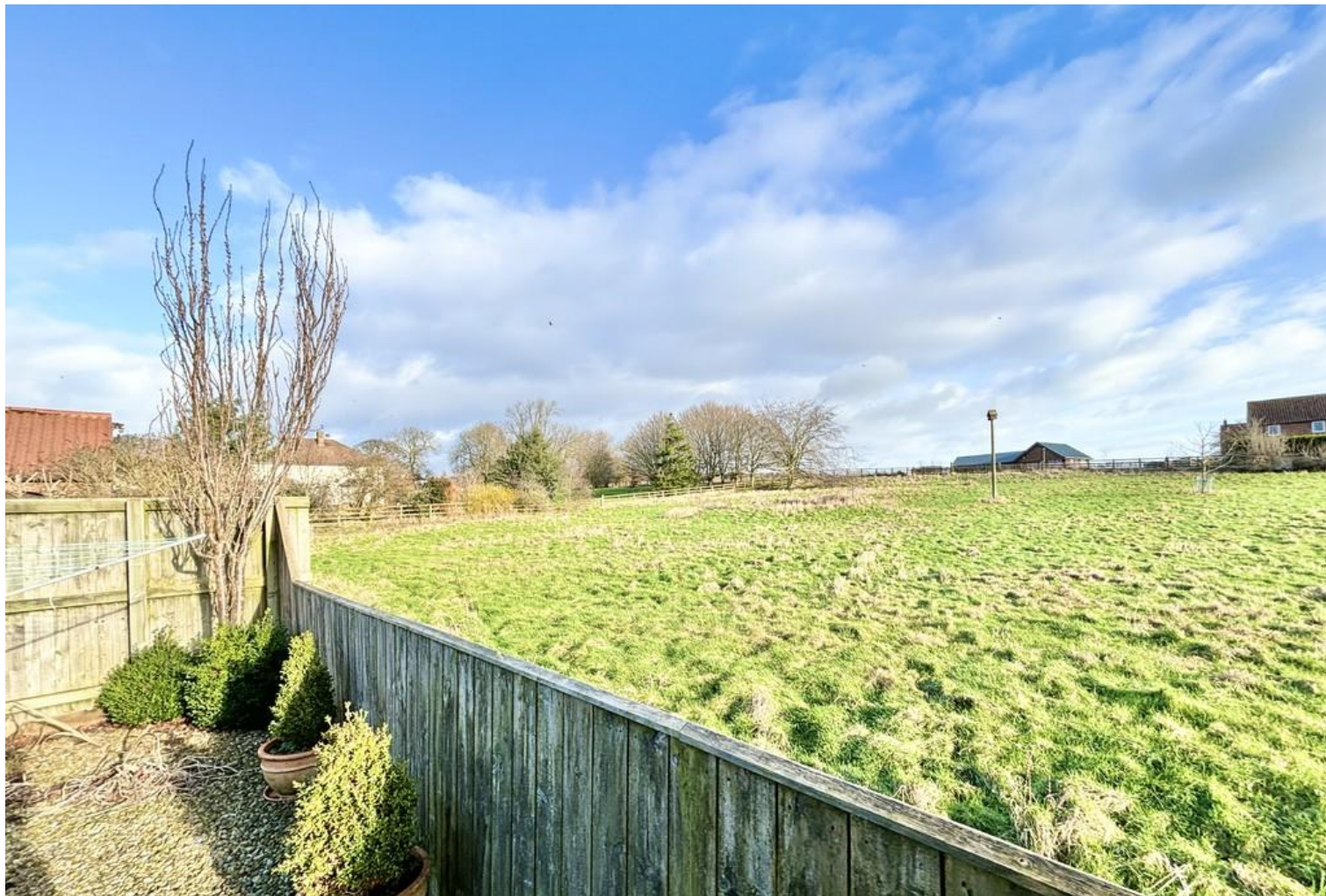
View from garden