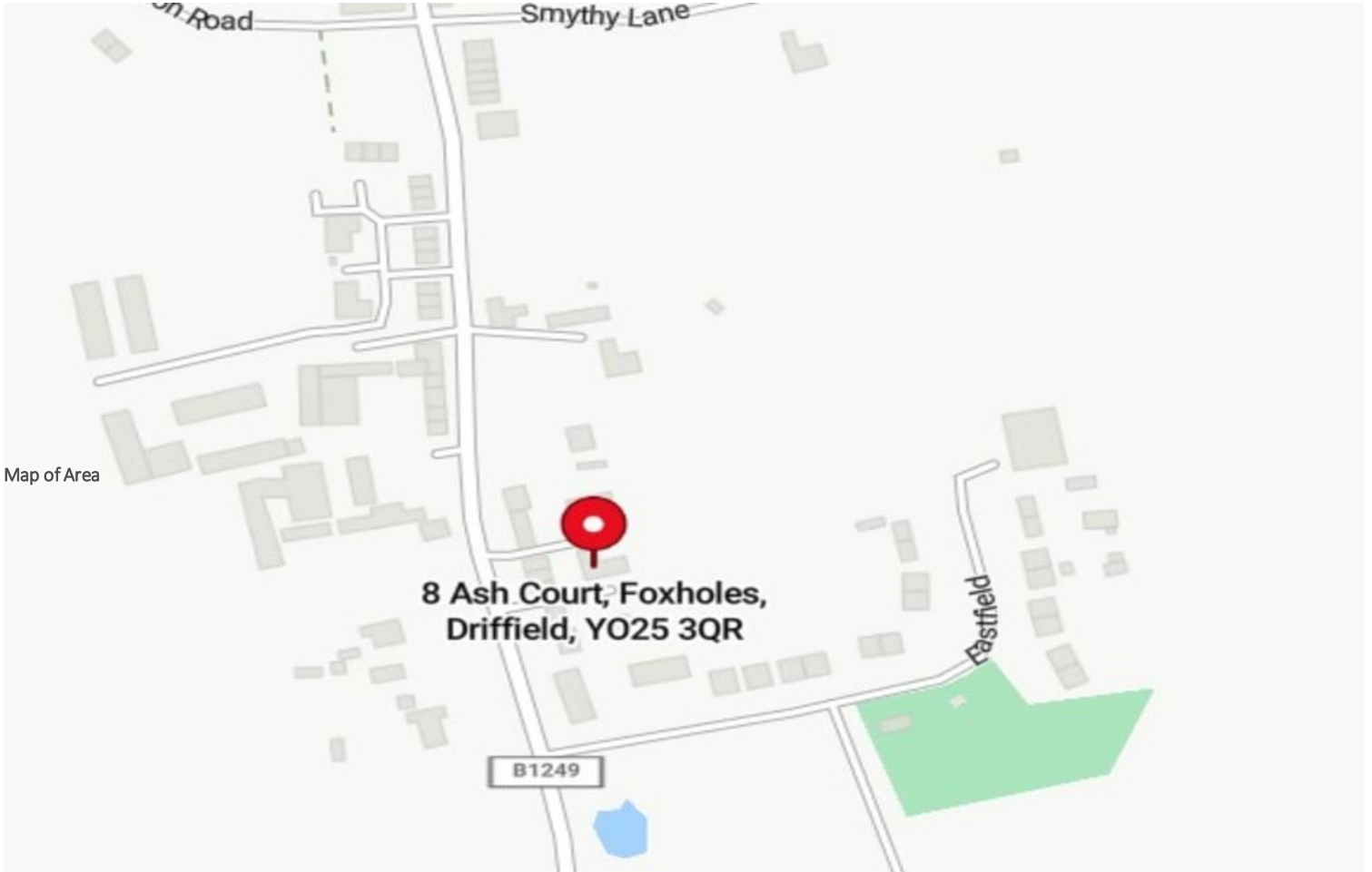
Map of Area