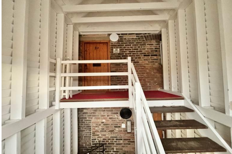
Stairwell to Flat