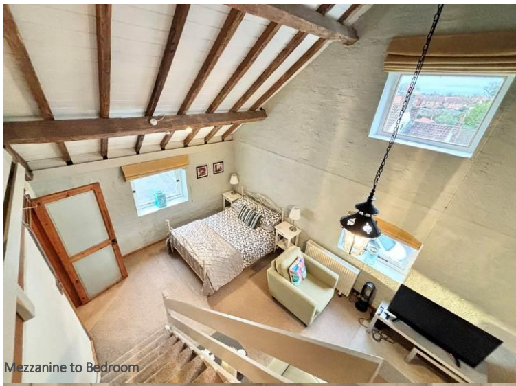
Mezzanine to Bedroom